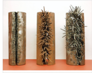
Three Cylinders Welded Steel 5" x 7" x 17"