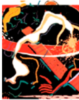
Diving Woman Acrylic / Canvas 40 x 48