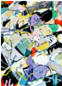
Static Movement Oil / Paper 18 x 24