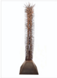
Untitled Welded Steel 17.5 x 17.5 " x 66.5"