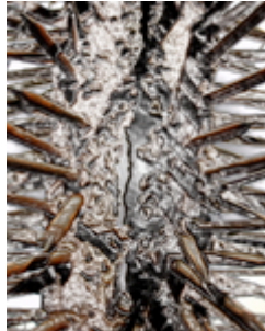
Mercury Steel Giclee Mono Print / Pencil 22 x 30