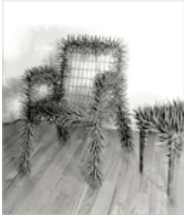
Chair & Table Welded Steel 24" x 33" x 26.5