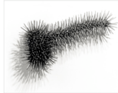
Hatchet Welded Steel 5" x 7" x 17"